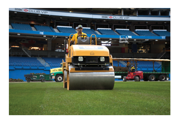
Rolling the field to enesure it was firmly adhered to the concrete floor.